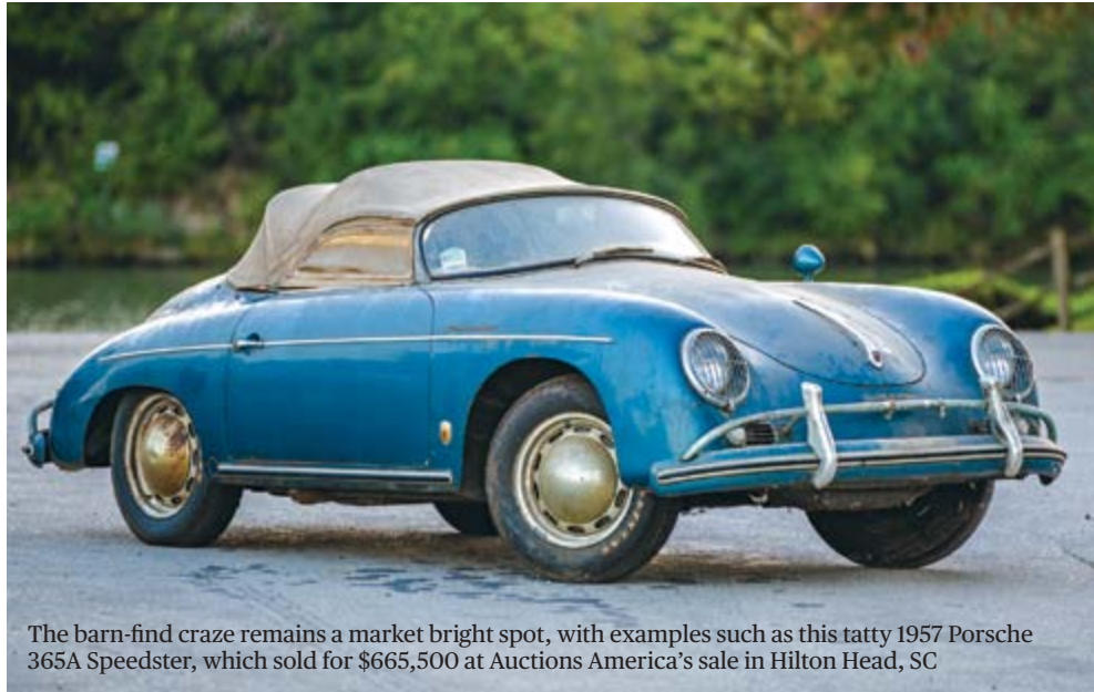
The barn-find craze remains a market bright spot, with examples such as this tatty 1957 Porsche 365A Speedster, which sold for $665,500 at Auctions America's sale in Hilton Head, SC

The Arizona Auctions hold something for everyone. It may be a good time to buy models where supply exceeds demand